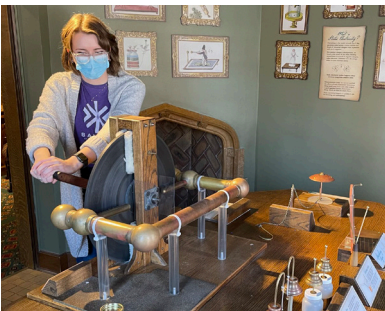
BEN FRANKLIN'S ELECTRICITY PARTY