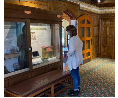
18TH CENTURY ROOM