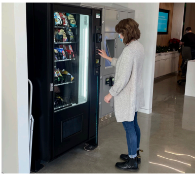
SNACK AND LOUNGING