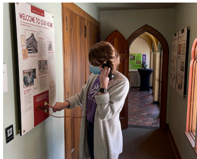
ABOUT THE WEST WINDS MANSION