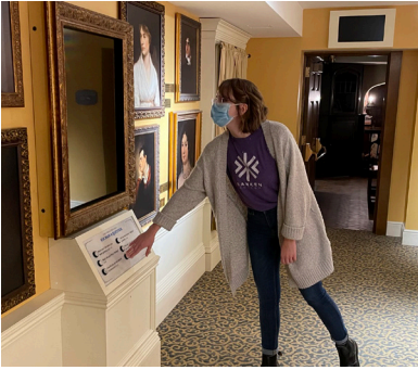
MARY & HER MONSTER

Cut these cards out to plan your visit in advance. A printed copy of this planner is also available at the Visitor Services Desk in the museum.