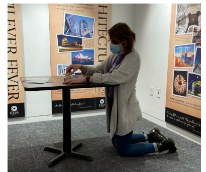
KEVA PLANKS GALLERY